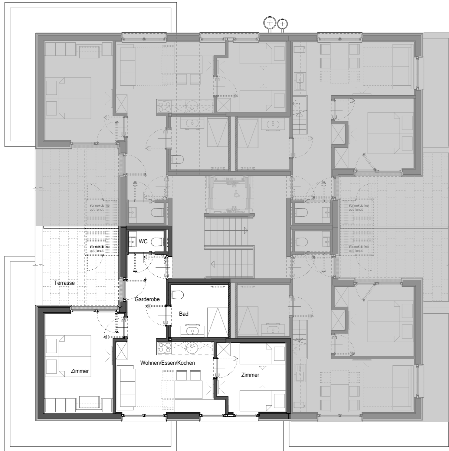
Grundriss Haus 2 E+5 M 1:100